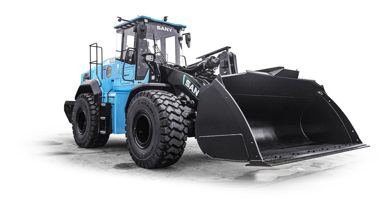
Image 5: The new 20t class wheel loader SANY SW956E - fully electric.

Putzmeister Concrete Pumps GmbH Niederlassung Bedburg Sany Allee 1 50181 Bedburg Germany