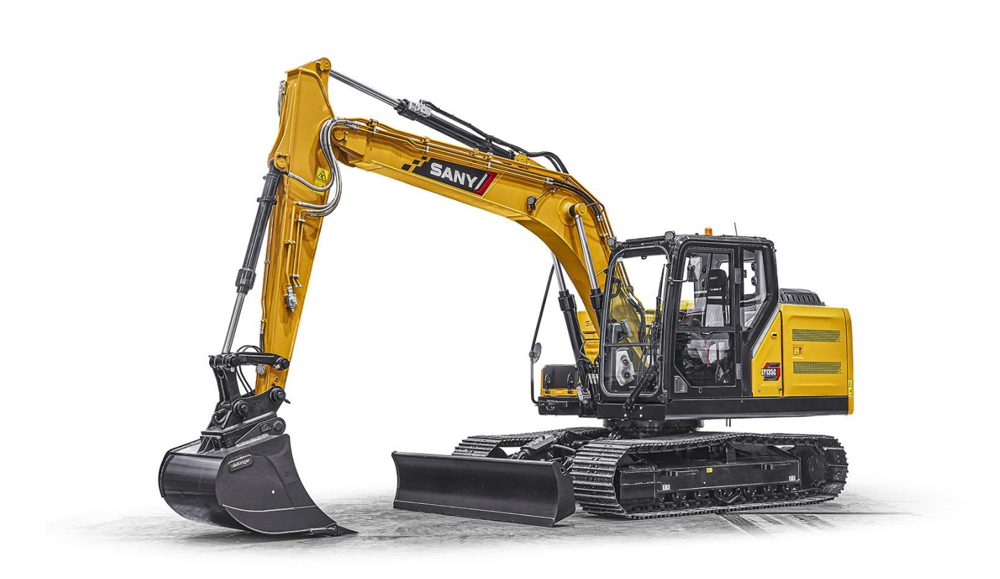
Image 1: SANY SY135C update – with redesigned cab and further improvements

Putzmeister Concrete Pumps GmbH Niederlassung Bedburg Sany Allee 1 50181 Bedburg Germany