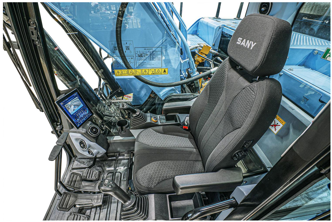
Image 3.2: In addition to the electric drive, the cab has also been given a new and modern look

Phone: +49 7127 599-0 E-MAIL pcp@putzmeister.com www.sanyeurope.com