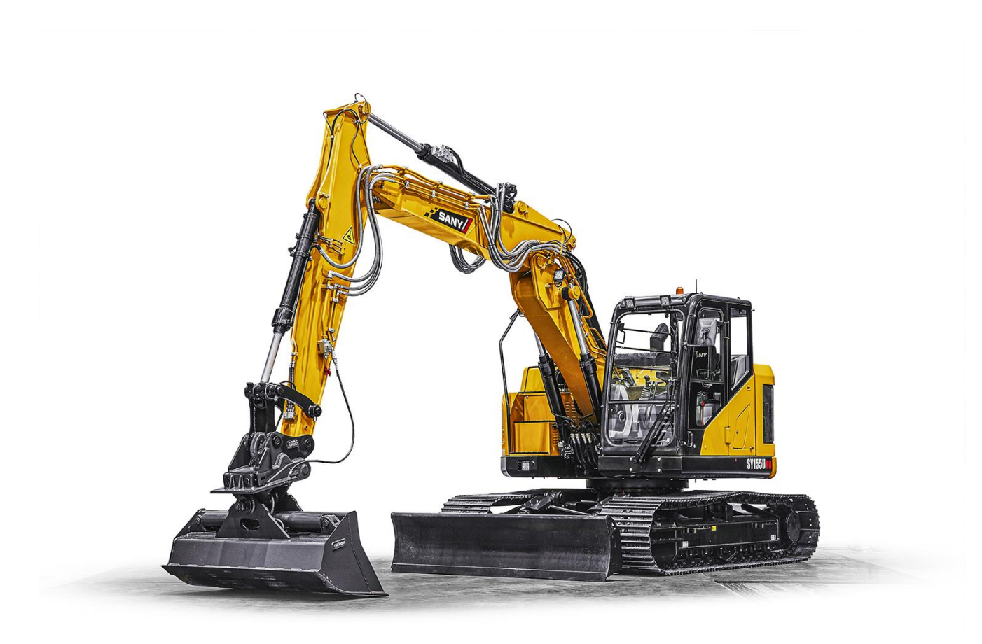
Image 2: SANY SY155U update - with 2-piece-boom and various comfort adjustments

Phone: +49 7127 599-0 E-MAIL pcp@putzmeister.com WEB www.sanyeurope.com