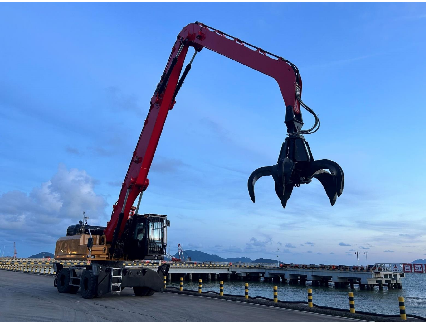
With an extended 17-meter loading equipment, the 40-ton material handler is ideal for heavy loading, lifting, and sorting tasks.