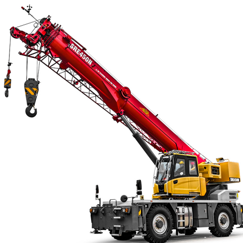
The SANY SRE450N rough terrain crane