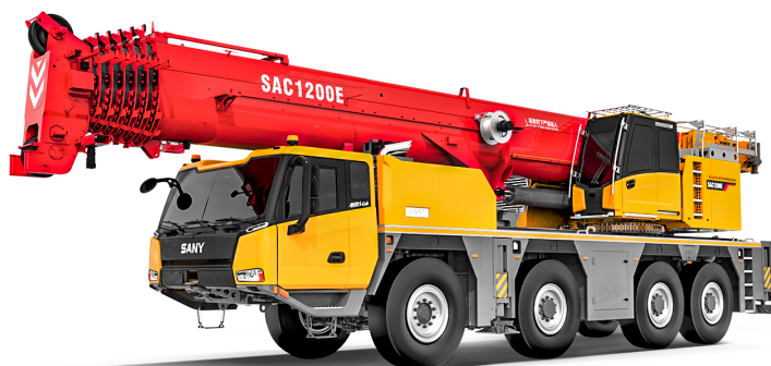
The SANY SAC1200E all-terrain crane

The internationally recognised brand Putzmeister, based in Aichtal near Stuttgart is also a company of SANY Heavy Industry.